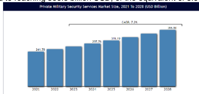
Figure 1. PMSC Industry Value Growth Estimates in 2021-2028

The point first strategy approach has so far failed because there are many limitations for partner countries—especially for countries that tend to be unstable, to be able to provide security. Then, for point 2, Chinese companies only have commercial interests, and tend to depend entirely on the Chinese government to provide security. Currently, the BRI phenomenon and its security needs are only at point 3, with the use of its Military/Private Security Industry - which will then be discussed in this article. The last two decades are evidence of increasingly massive growth in the Military/Private Security Industry. It is not known at this time the number of PMSCs worldwide, but based on Vantage Market Research (2022), in 2021, the Military/Private Security Industry will have a value of 241.7 Billion USD, or the equivalent of 3.8 Trillion Rupiah—and is projected to reaching 366.8 billion USD, or the equivalent of 5.9 Trillion Rupiah in 2028.